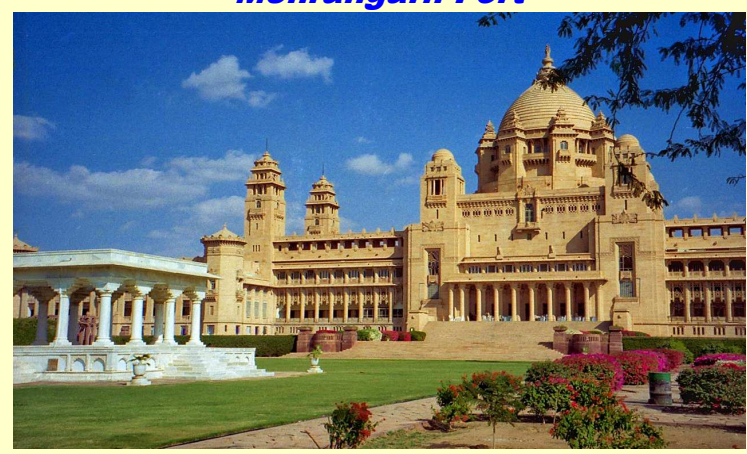
Umaid Bhawan Palace