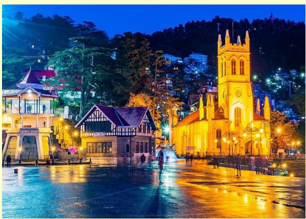
Christ Church, Shimla