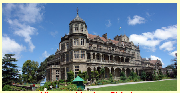
Viceregal Lodge, Shimla