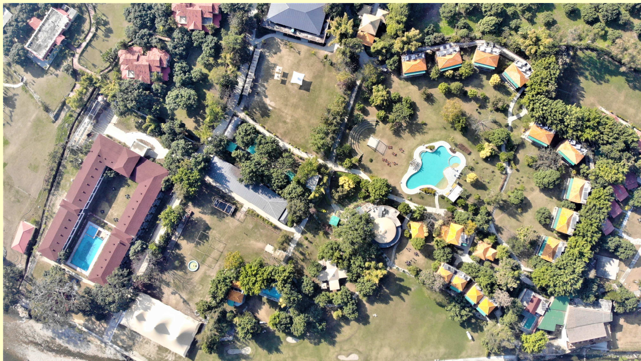
Tarangi Resort & Spa