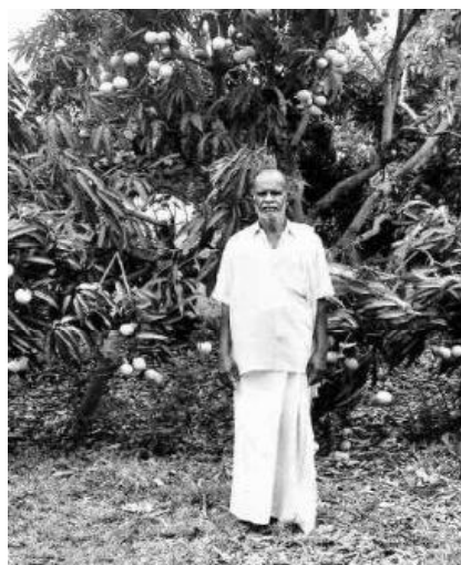
Figure 2 - A mango farmer (PV) in Mampakkam village in Tamil Nadu in his orchard (9).

procured the grafts from a local farm and had planted them at a spacing of about 6 feet in straight lines. Before planting, the